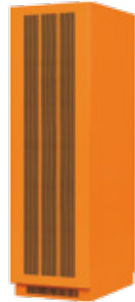
19" Matching Battery Cabinets (Optional)